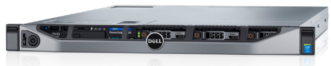
Figure 1: TVM5000 1u rack server