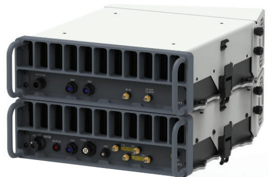
Figure 4: VIAVI T/Rx SDT and PA