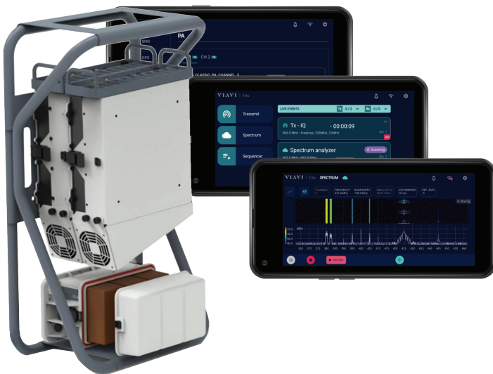
Figure 3: VIAVI T/Rx Manpack