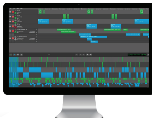
Figure 5: EMS Sequencer

EMS Sequencer software provides tools to schedule transmit and record operations on networked Ranger and T/Rx units. This software presents an intuitive user interface to schedule activities by placing tasks on a timeline associated with each Ranger or T/Rx unit. Each task can be associated with a waveform file, gain, power level, frequency, number of iterations, and other parameters needed to create a complex vignette. When executed, EMS Sequencer coordinates the transfer of all required files and parameters while coordinating each task with precision timing.