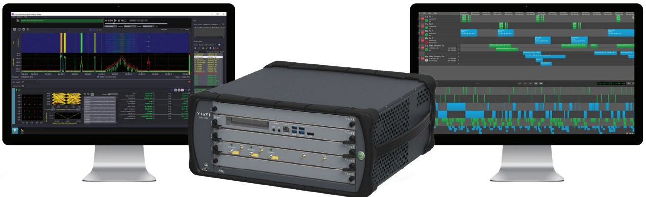
Figure 2: VIAVI Ranger